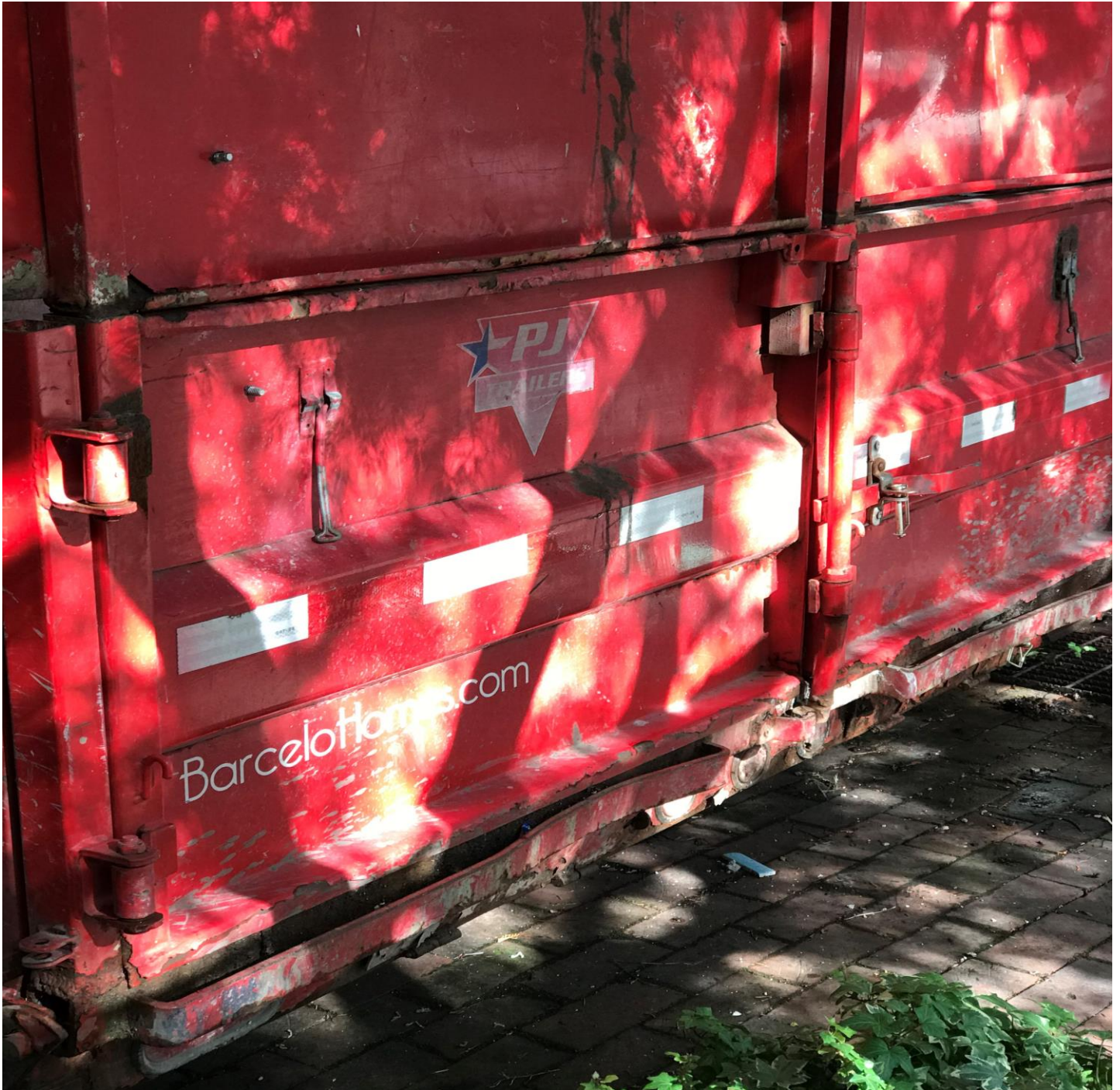
Exhibit 2-A: Initial investigation and stop work order posted. Barcelo Homes Inc. Equipment Photo taken 10/12/2020.