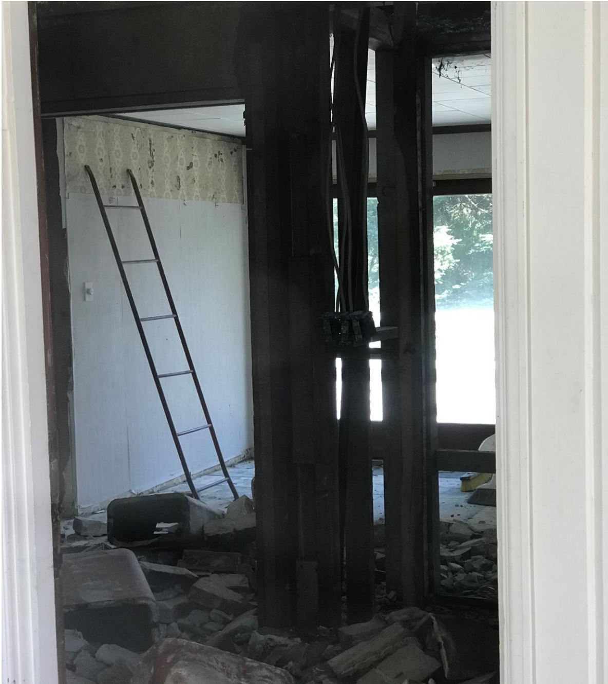
Exhibit 3-A: Initial investigation and stop work order posted. Demolition of walls and chimney, in plain view through clear glazed front entry doorway. Photo taken 10/12/2020.